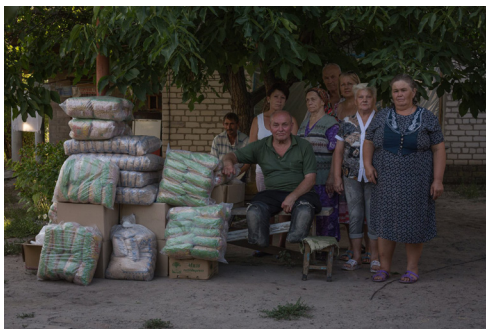
Internally displaced persons with disabilities in Ukraine