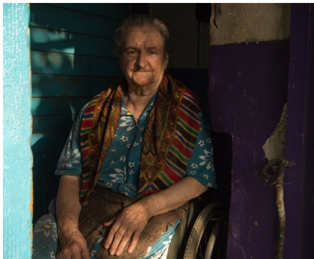
Opytne. Donetsk region. Opytne is in the GCA, just a few miles from the destroyed Donetsk airport. This woman, like many of her neighbors, is living in a basement. When there is no shelling, her neighbors help her to the front door of the building for a moment of fresh air and sunlight.