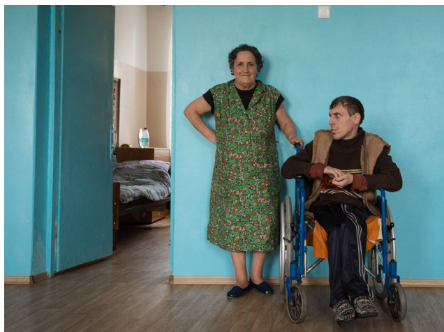
Myrne. Donetsk region. Mother and son both have congenital cerebral palsy. Their house in the town of Granitne was destroyed during the first shelling, and they now reside in the town of Myrne ("Peaceful"), in the Ukrainian-controlled territory, in a makeshift nursing home (the building was previously a school) for PWD and the elderly. The nursing home is staffed entirely by volunteers.

how many PWD have requested asylum or permanent residence in neighboring countries, but disability rights activists estimate that at least 22,000 PWD are still living in the city of Luhansk, with thousands more throughout the NGCAs.