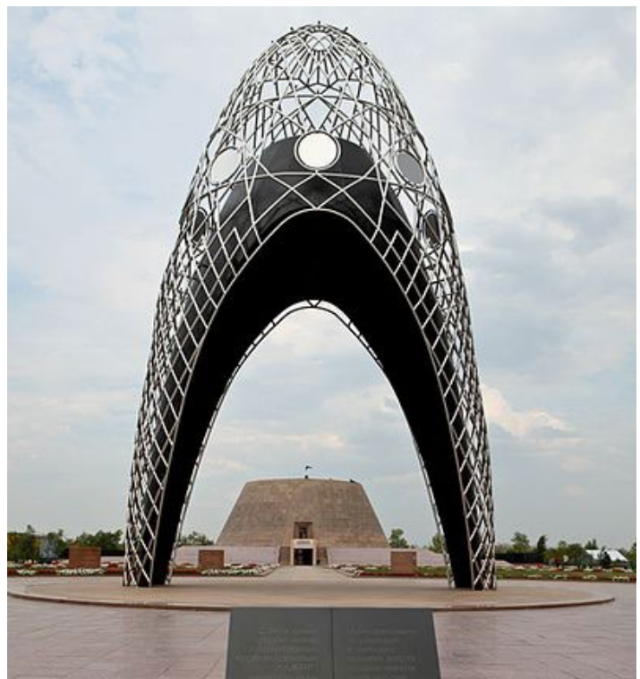
"Monument to the victims of the Akmola Labour Camp for Wives of Political Dissidents during Soviet times" Astana (now Nur-Sultan), Kazakhstan. Photo taken: July 12, 2012

In 2017, Nazarbayev announced plans to move the Kazakh alphabet to a new script based upon the Latin alphabet. The final version of the script was approved in 2018, with the transition to be completed by 2025. Proponents of the new alphabet have celebrated it as long overdue move away from the Soviet past and Russian influence. Under Soviet rule, Kazakh, a Turkic language, underwent several shifts, moving from the Arabic to the Latin script in the 1920s and then in the 1940s to the Cyrillic script, which has remained in use in Kazakhstan to the present. When he announced the new Kazakh