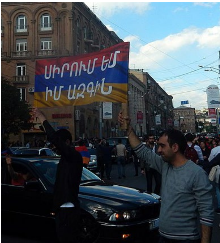
“‘Love My Nation’ poster during Armenian Velvet Revolution”

The new Armenian government views the country’s economic alliance with Russia, including membership in the EEU, as flawed but necessary. Armenia’s residents and new authorities grumbled when Russia